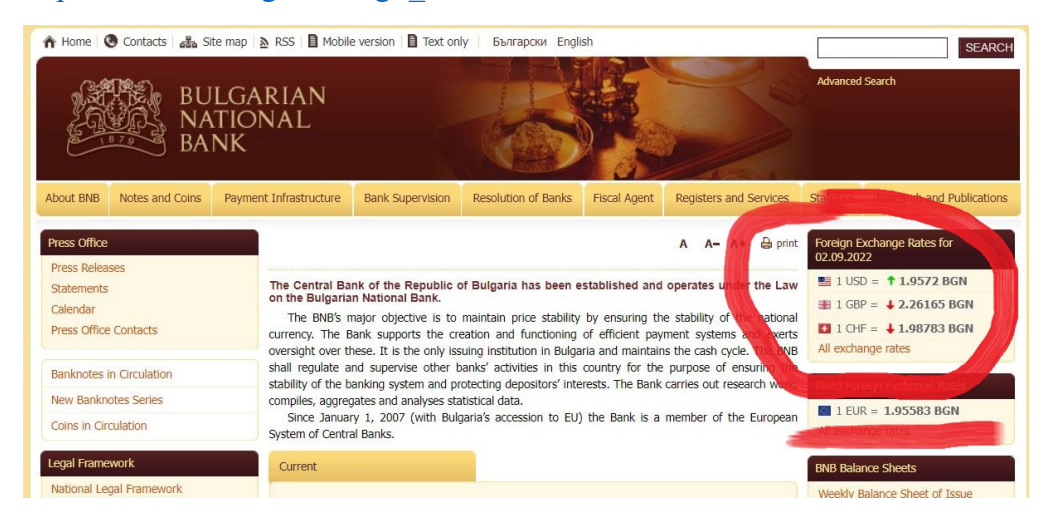
In other words, 50 euros/dollars equal 100 Bulgarian levs.

4. At the airport you could exchange some money if you would like to pay a taxi to the hotel in the local currency, but taxi drivers would not mind taking euros and/or dollars. A taxi from the airport to Akord Hotel will cost you about 20 euro/USD.